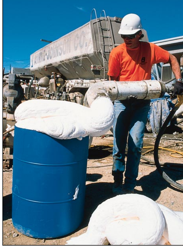
Containing large volumes of air, preformed foam has the consistency of shaving cream. Contractors can control the density and compressive strength of cellular concrete onsite by varying the amount of foam injected into it.