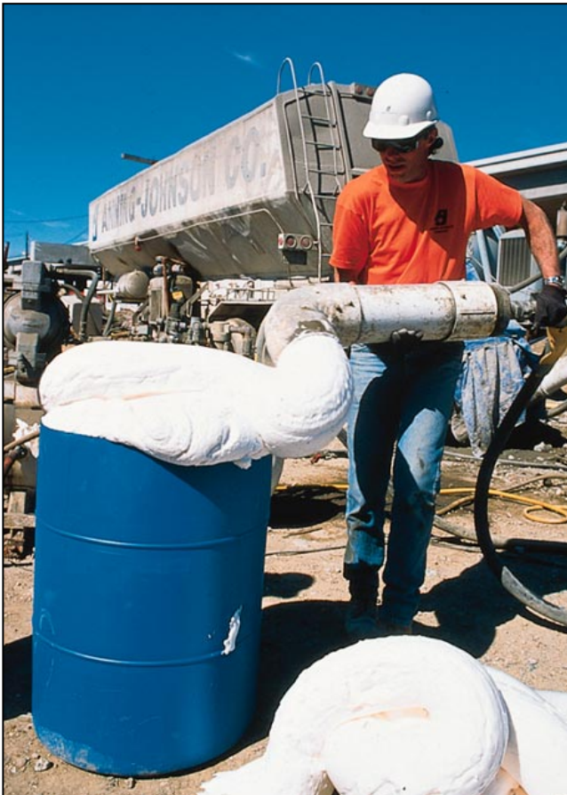
Containing large volumes of air, preformed foam has the consistency of shaving cream. Contractors can control the density and compressive strength of cellular concrete onsite by varying the amount of foam injected into it.